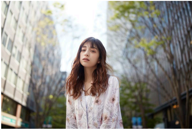
Focal Length: 35mm Exposure: F/1.4 1/800sec ISO: 100

To deliver a perfect image to people who love photography; that's our obsessive goal for all Tamron lenses. The Tamron SP 35mm F/1.4 Di USD (Model F045) is our most shining example. The exceptional image quality of this fast fixed focal lens makes it worthy of being the lens that marks the milestone 40th anniversary of the SP (Superior performance) Series. We wanted to know what kind of lens would result if we focused our accumulated expertise and technologies purely on lens performance in pursuit of image quality. In other words, could we create the greatest Tamron lens ever? All of Tamron's technical competence and new coating technologies have been compounded to finally complete the finest lens in Tamron's history. Uncompromising resolution at wide-open aperture combines with Tamron's distinctive bokeh and superior handling characteristics. Experience its performance for yourself. It will give you a better way to see the world.