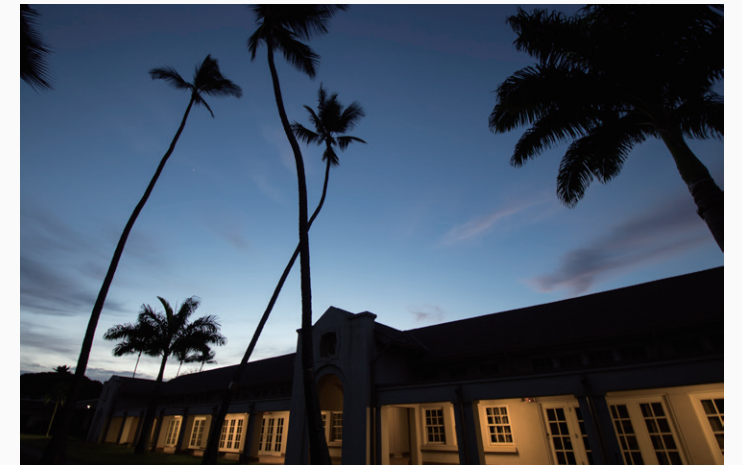
Focal Length: 10mm Exposure: F/3.5 1/6sec ISO: 100

Tamron's unique VC technology makes it easy to enjoy handheld, wide-angle shooting, even in low-light environments such as evening and indoors. Now you can unleash the power of high quality imaging, without worrying about your images being spoiled by the jittery effects of handheld shooting.