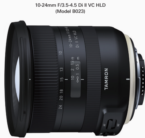
10-24mm F/3.5-4.5 Di II VC HLD (Model B023)