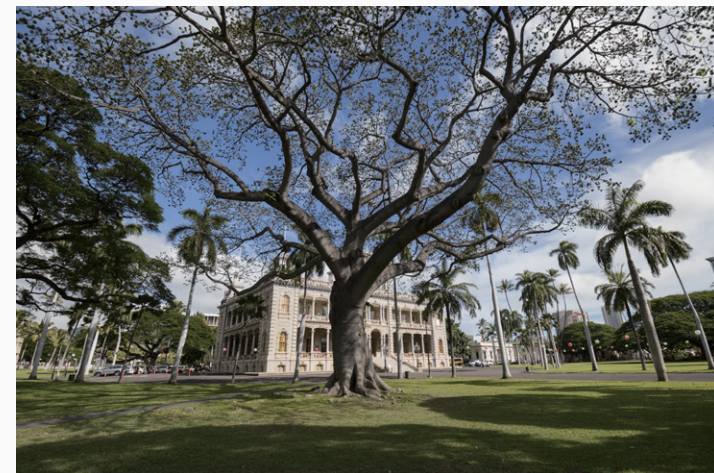
Focal Length: 10mm Exposure: F/5.6 1/750sec ISO: 200