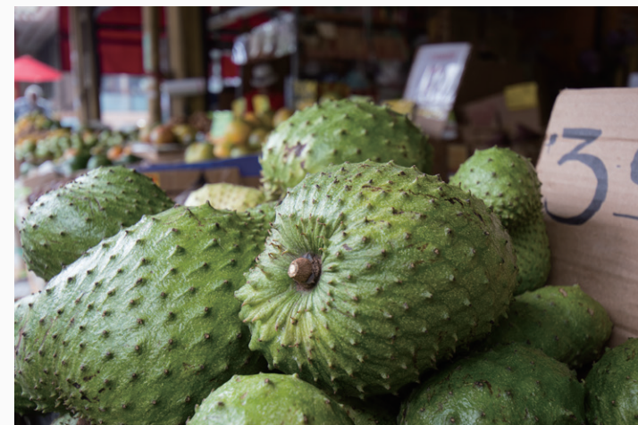
Focal Length: 24mm Exposure: F/4.5 1/60sec ISO: 100