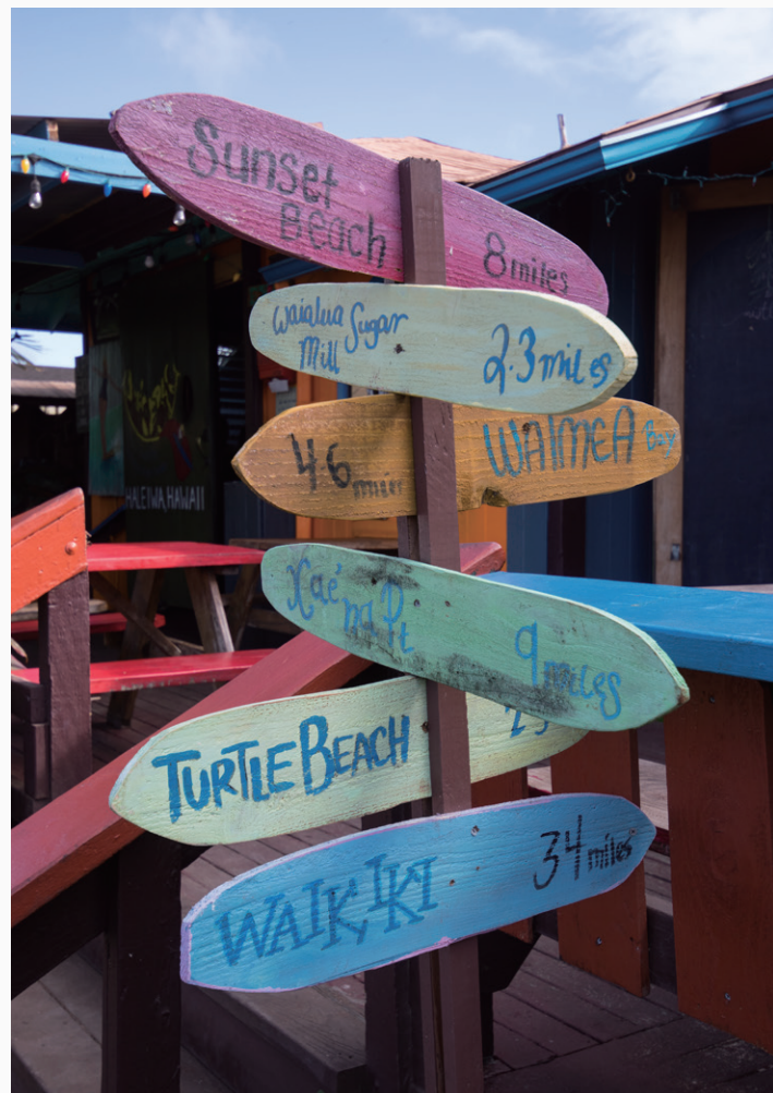
Focal Length: 24mm Exposure: F/5.6 1/180sec ISO: 100