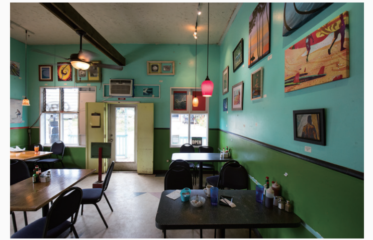
Focal Length: 10mm Exposure: F/5.6 1/45sec ISO: 400

The optical design includes 16 elements in 11 groups. A new large aperture aspherical lens and LD (Low Dispersion) lens elements deliver exceptional resolution across the complete zoom range — combined with stable imaging across the entire frame. The lens also corrects comatic and transverse chromatic aberration, as well as distortion that often crops up on other wide-angle lenses. Together with Tamron's unique BBAR (Broad-Band Anti-Reflection) Coating, which improves light transmission and suppresses reflection and dispersion on the lens surface, this new ultra-wide-angle zoom has been entirely reimagined to control flare and ghosting. The result: clear, crisp images, every time.