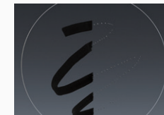
Image illustrates resistance to grime (oil-based felt marker) left side: Without Fluorine Coating right side: With Fluorine Coating

The front surface of the lens element is coated with a protective fluorine compound that is water- and oil-repellant. The lens surface is easier to wipe clean and is less vulnerable to the damaging effects of dirt, dust, moisture and fingerprints. Leak-proof seals throughout the lens barrel further protect your equipment, especially when shooting outdoors.