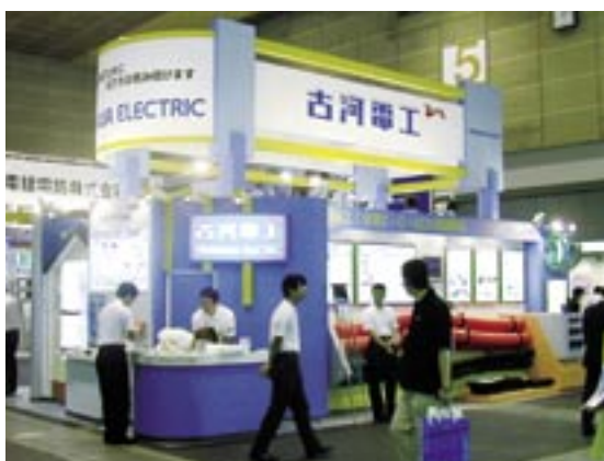
Electrical Construction Equipment and Material Fair 2002

Furukawa Electric's products and technological information including environment-friendly products are exhibited at major exhibitions around the country.