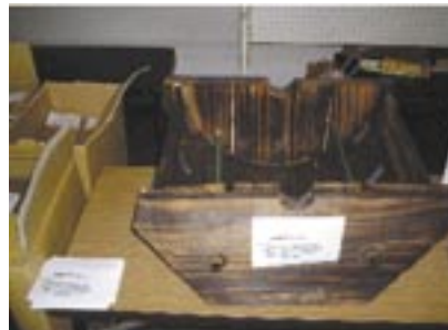
Eco-Fair Ichihara Planter boxes made of recycled wooden drums are exhibited.

Since fiscal 2002, the Chiba Works actively participates in "Eco-Fair Ichihara" that is held in the Ichihara Citizen Hall.