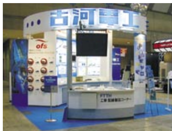
Fiber Optics Expo 2003