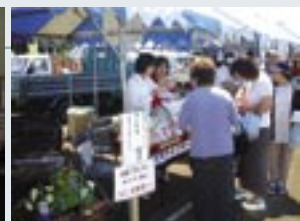
Yawata Coastal Area Fair