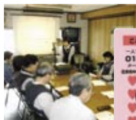
Mental health education by nursing staff