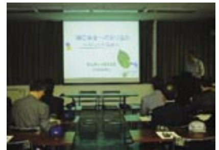
Explanation of environmental activities is given to the visitors