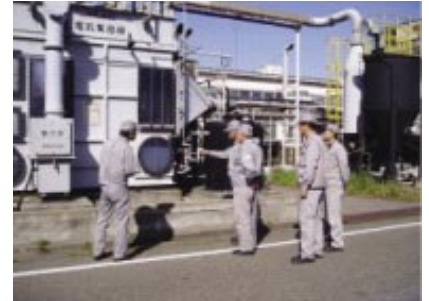
Environmental area patrol