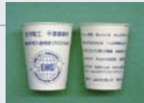
Paper cup with environmental catchphrase

Through complete separation of the waste generated in the Works, the volume of waste disposed of in landfills in fiscal 2002 significantly decreased by 62.5 % over fiscal 2000, and the total volume of waste by 51 %. Now the activity extends to daily-life features such that paper cups at vending machines are recycled and that garbage from the company cafeteria is being turned into compost.