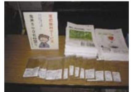
Eco-Fair Ichihara Organic fertilizer made from garbage from the company cafeteria is exhibited and delivered at no charge.