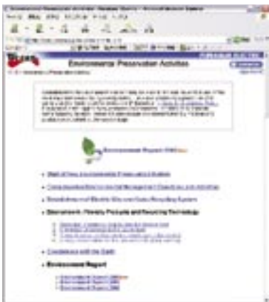
Furukawa Electric's website http://www.furukawa.co.jp/english/index.htm

On our website, under the title of "Environmental Preservation Activities" we disclose how Furukawa Electric is promoting its environmental preservation initiatives, and present, since fiscal 2000, previously published environmental reports in PDF. The environmental report on the website is upgraded every year by December.