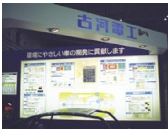
Automotive Engineering Exposition 2002