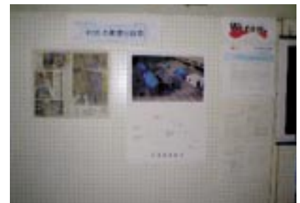
Eco-Fair Ichihara Disposition of PCB is exhibited and illustrated using a VTR.