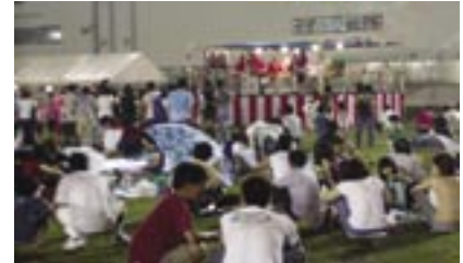
A scene of summer evening festival