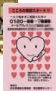
User card for outside EAP advice to be carried by employees

order to standardize the check-up work and to improve the daily life. This enables us to unify the management of health information and to compare the data from diversified viewpoints. Thus, health conditions ranging from a group to individuals can be grasped to be developed into guidelines for a better daily practice, thereby reforming the health consciousness of all employees.