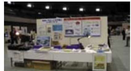
Presentation of a booth at the environmental fair sponsored by Mie Prefecture