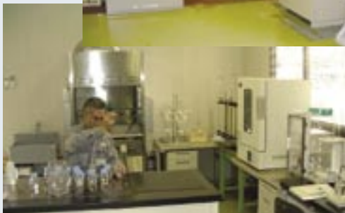
Analysis room for wastewater

Because it is located in an inland area, the Mie Works is carrying out environmental preservation activities placing special emphasis on wastewater quality control, whereby stringent voluntary levels are set up and an automatic supervisory and alarming system for control items is installed to quickly detect any abnormalities in wastewater quality. Moreover, in view of the Fifth Immutable Weight Control against Wastewater Quality to be applied in April 2004, an automatic analyzer for total phosphorous and total nitrogen in wastewater has been installed to enable full-time monitoring using the automatic supervisory and alarming system. In addition, an empty reservoir for emergency use is provided in case of water quality eventualities.