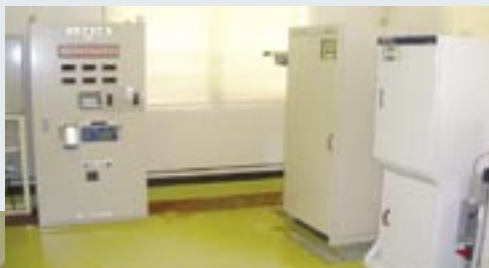
Automatic monitoring equipment for wastewater