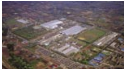
Aerial photograph of Mie Works

The Mie Works was established in 1971 in the superb natural surroundings at the foot of the Suzuka mountain range as a business base of Furukawa Electric in the Chukyo and Kansai areas. The Works manufacture not only nonferrous materials such as copper products, copper wire and magnet wire, but also optical fiber cable, automotive products and plastic products, thus consolidating its position as a backbone business base both in name and reality. The Works is actively communicating with the local communities through such activities as summer evening festivals and factory tours inviting near neighbors.