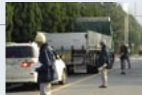
Members of EMS Promotion Committee distributing leaflets

In response to the fact that “Stop Idling” became compulsory by the Environmental Preservation Ordinance of Chiba Prefecture, members of the EMS Promotion Committee distributed leaflets on “Stop Idling”, positively pursuing enlightenment activities.