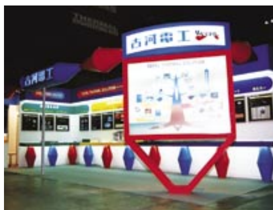
Thermal Solution Technologies in Techno-Frontier Week 2002