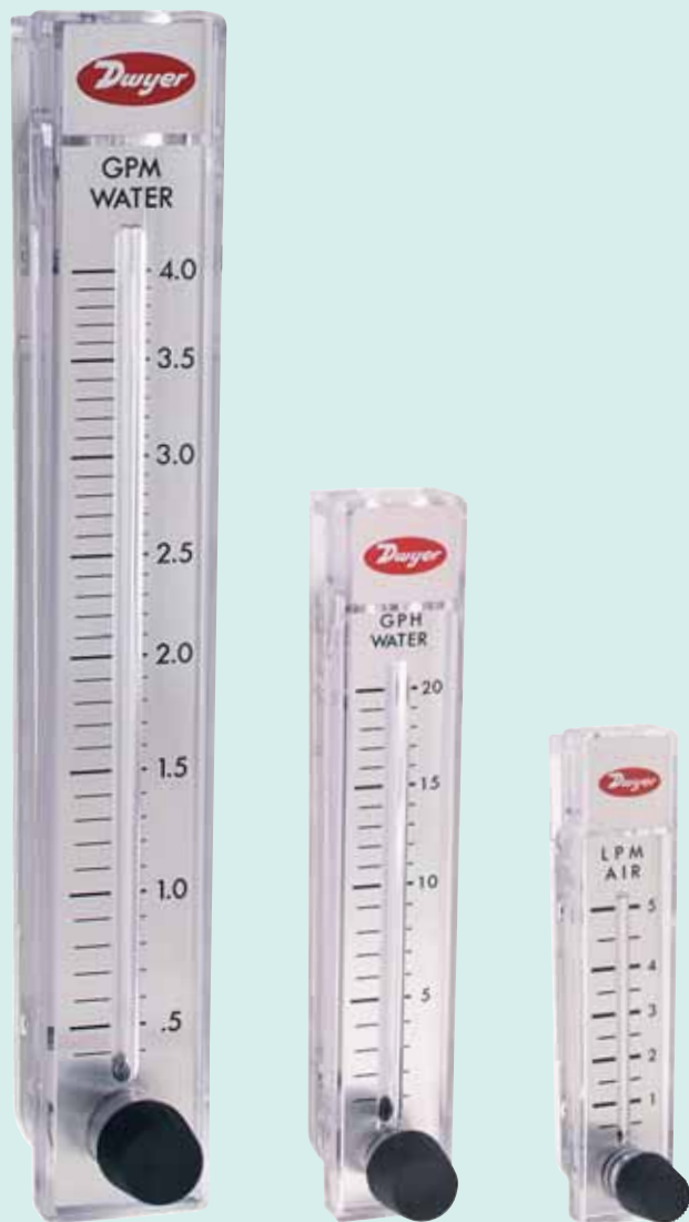
Model RMC-SSV 10" scale, 15-3/8" high