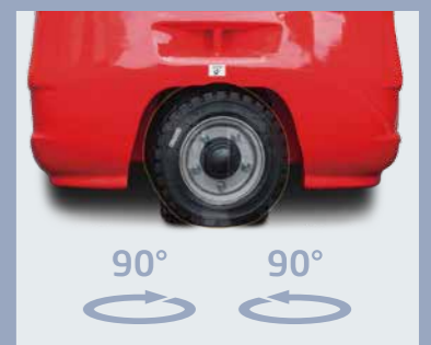
The small turning radius is suitable for narrow channel