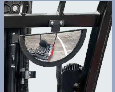
Panoramic rearview mirror