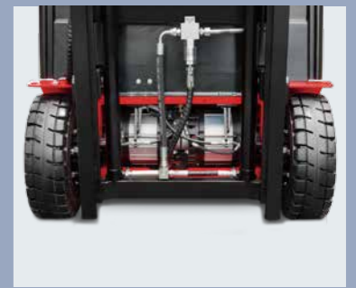
Front dual separated motors